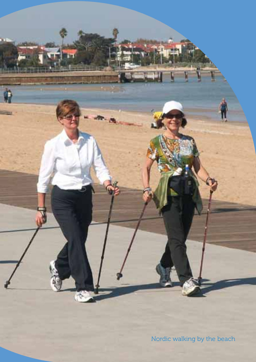
Nordic walking by the beach